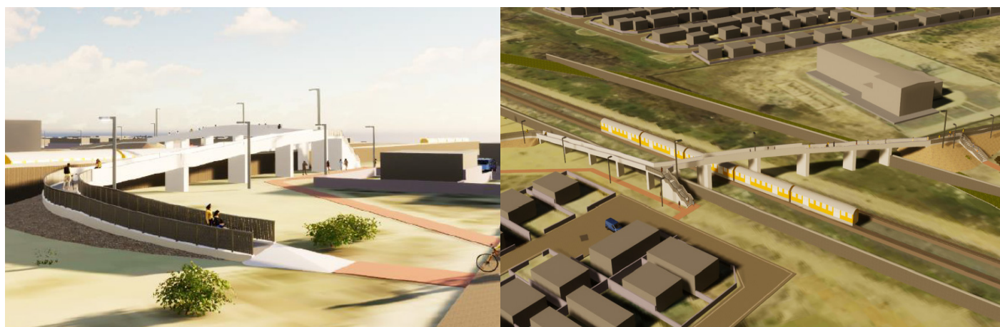
Artist impressions of the new bridge linking residents with MyCiTi services and other shops and services along AZ Berman Drive.

With work set to commence soon involving heavy construction vehicles, residents are urged to avoid the construction site for their own safety.