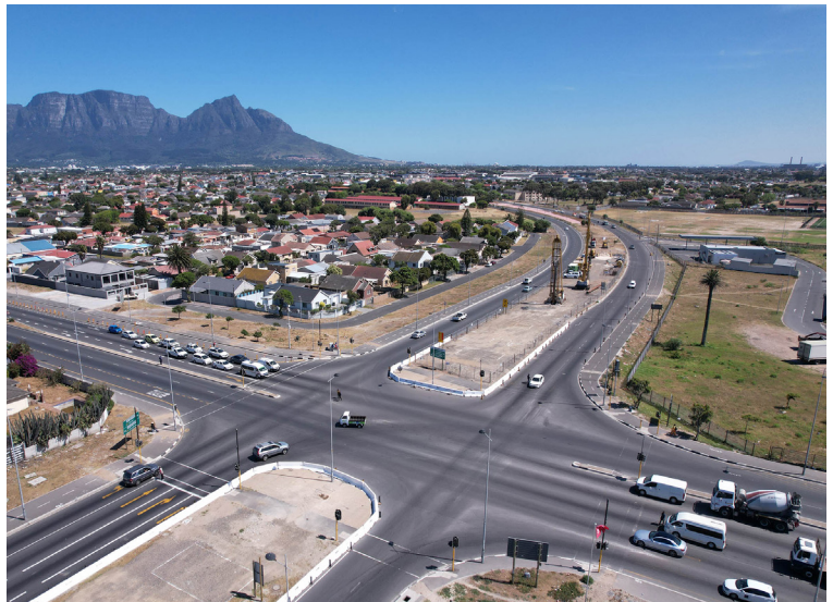
Construction is being undertaken in phases to limit the impact on traffic.