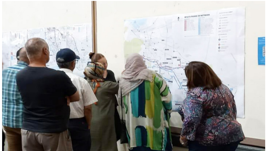
Residents in Wynberg helped identify locations for new bus stops in the area.

We would like to extend a special thank you to everyone who was able to join us at these events as well as to everyone who submitted comments. There is still an opportunity to comment on some of the proposals. Once the public comment period for each