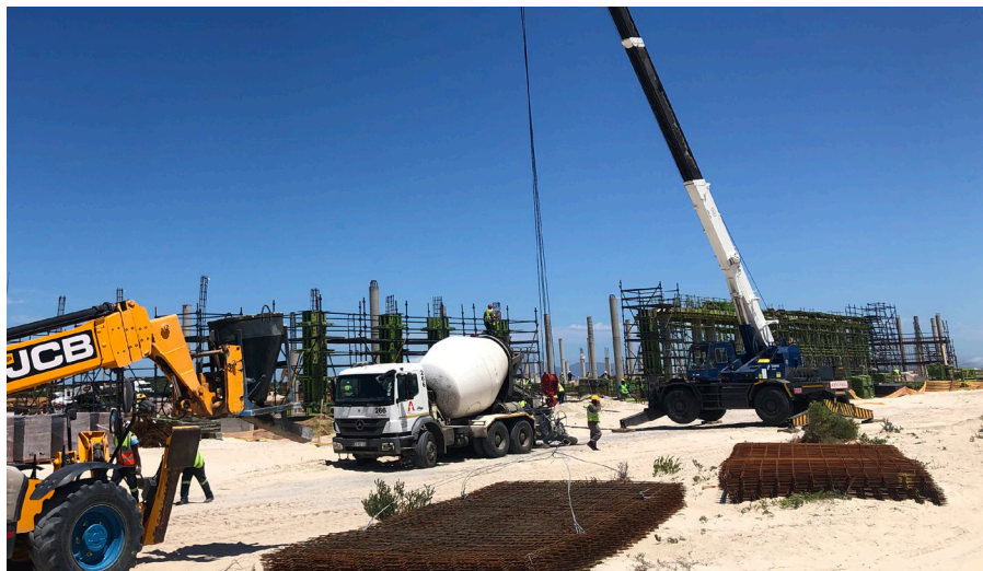
The depots will house buses serving the Phase 2A routes to Khayelitsha and Mitchells Plain.

Residents are reminded of local temporary job and sub-contracting opportunities for those registered on the Jobseekers' Database at their local Subcouncil office. Road users are advised to look out for